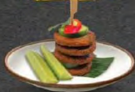
THAI FISH CAKE 4 pcs