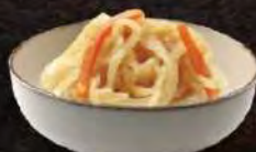
STIR FRIED VEG