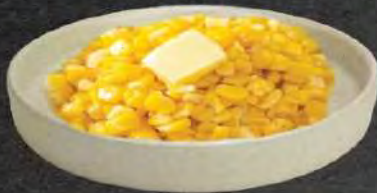
BUTTER SWEET CORN