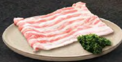
SLICE PORK BELLY 200g