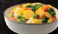
MIXED STEAMED VEG