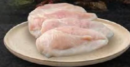
MARINATED GINGER CHICKEN THIGH 160g