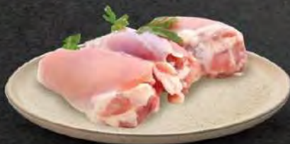
BONELESS HONEY SOY CHICKEN THIGH 160g