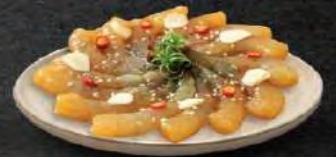
MARINATED PRAWN 8 pcs