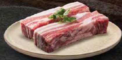
PORK BELLY 200g