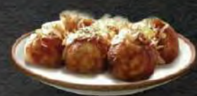
TAGOYAKI 6 pcs