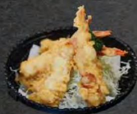
PRAWN TEMPURA 4 pcs