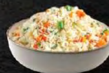
EGG FRIED RICE