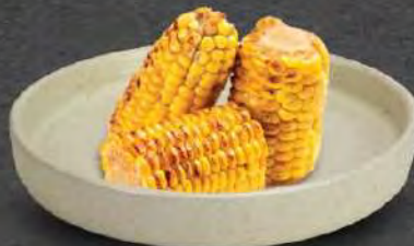
SWEET CORN COB