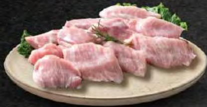
PORK JOWL 180g