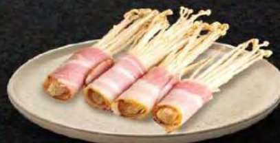
ENOKI ROLL WITH BACON