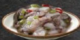
WASABI TAKO (Octopus)