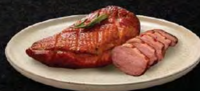
ROASTED DUCK 160g