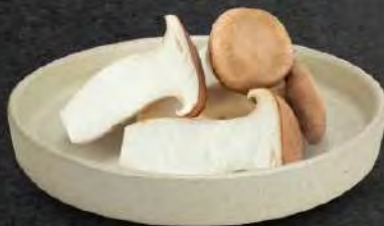
KING OYSTER MUSHROOM