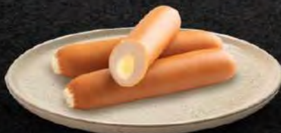
PORK SAUSAGE CHEESE