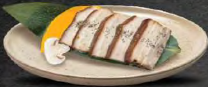
SLOW COOKED PORK BELLY 160g