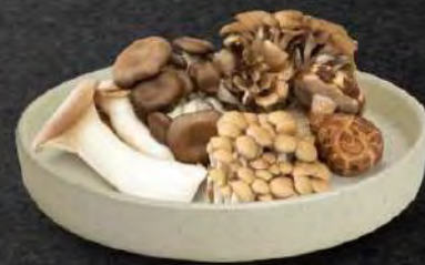
ASSORTED MUSHROOM (Seasonal)