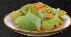
CABBAGE FISH SAUCE (vg)