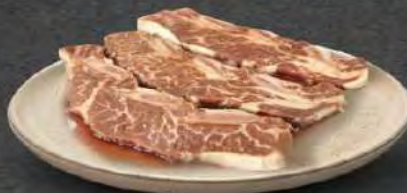
MARINATED PORK RIBS 220g