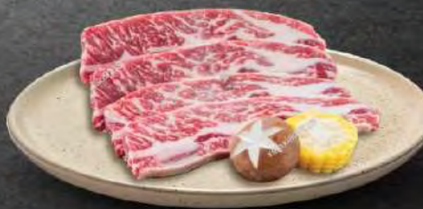
MARINATED SHORT RIBS