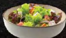
MIX SALAD (small size only)