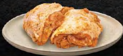
SPICY CHICKEN THIGH FILET 160g