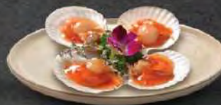
GARLIC BUTTER & CHEESE SCALLOP