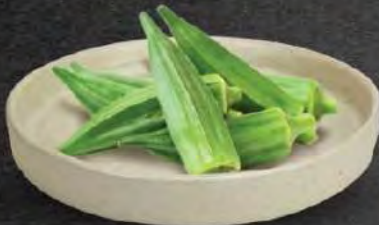
FRESH OKRA (Seasonal)