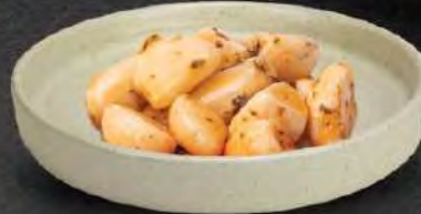
GARLIC SESAME OIL